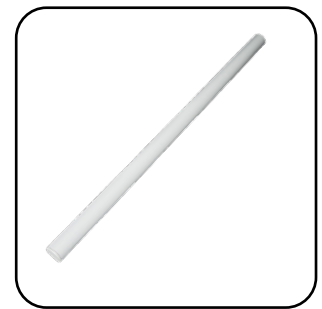
C - Top Arm