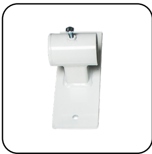
A - Closed Wall Bracket x 2