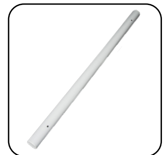
F - Bottom Arm