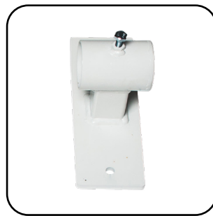
B - Open Wall Bracket x 2