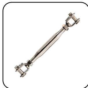
E - Tensioners x 2