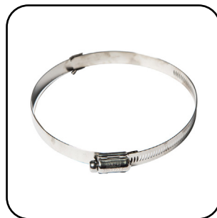
B - Banding Straps x 4