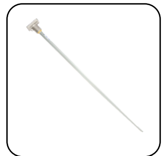
C - Banner Arm x 2