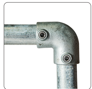
C - Corner Connectors x 2