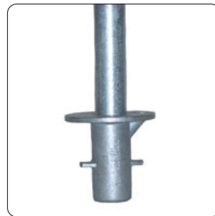
E - Ground Sleeve x2