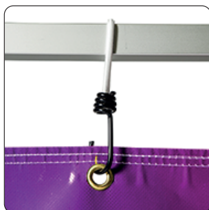
D - Bungees