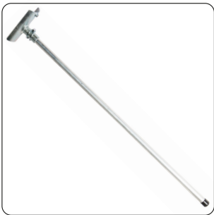
D - Metal Arm x2