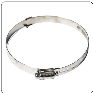
B - Banding Strap x4