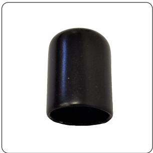
E - Plastic End Caps x 2