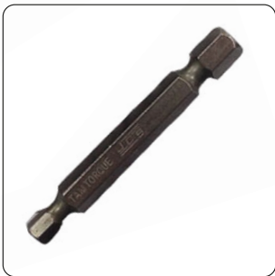
C - Drill Bit Tool x1