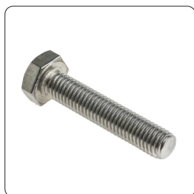
B - Base Bolt