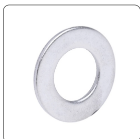
E - Flat Washer