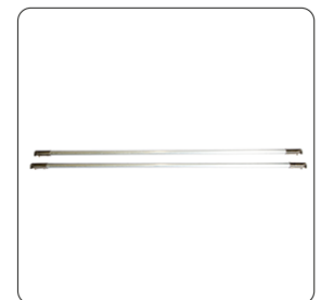
H - Crossbar