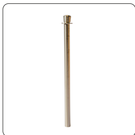
F - Stainless Steel Post