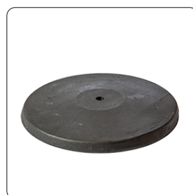
C - Base