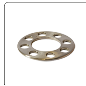
G - Floating Disks