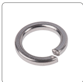
A - Spring Washer