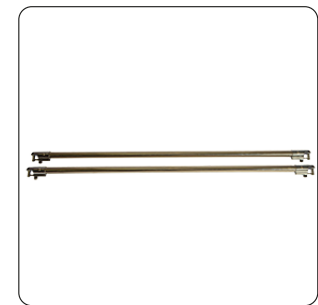
F - Crossbar