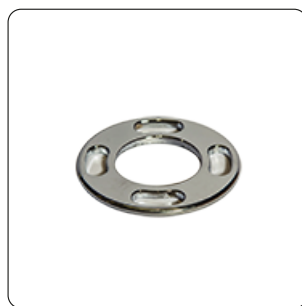
B - Floating Discs