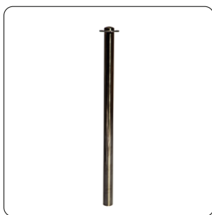
A - Steel Post