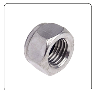
C - Locknut