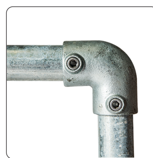
C - Corner Connectors x 2