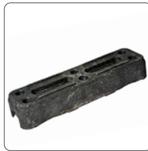
E - Rubber Base