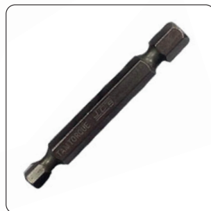
E - Drill Bit Tool x1