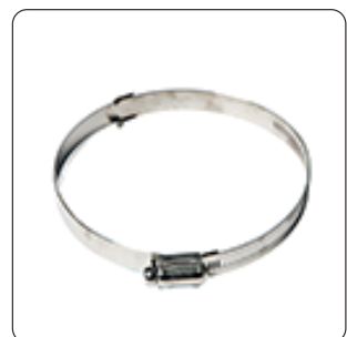
F - Banding Strap x6