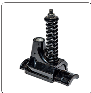
A - Bracket x2