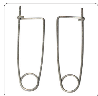
C - Pin x2