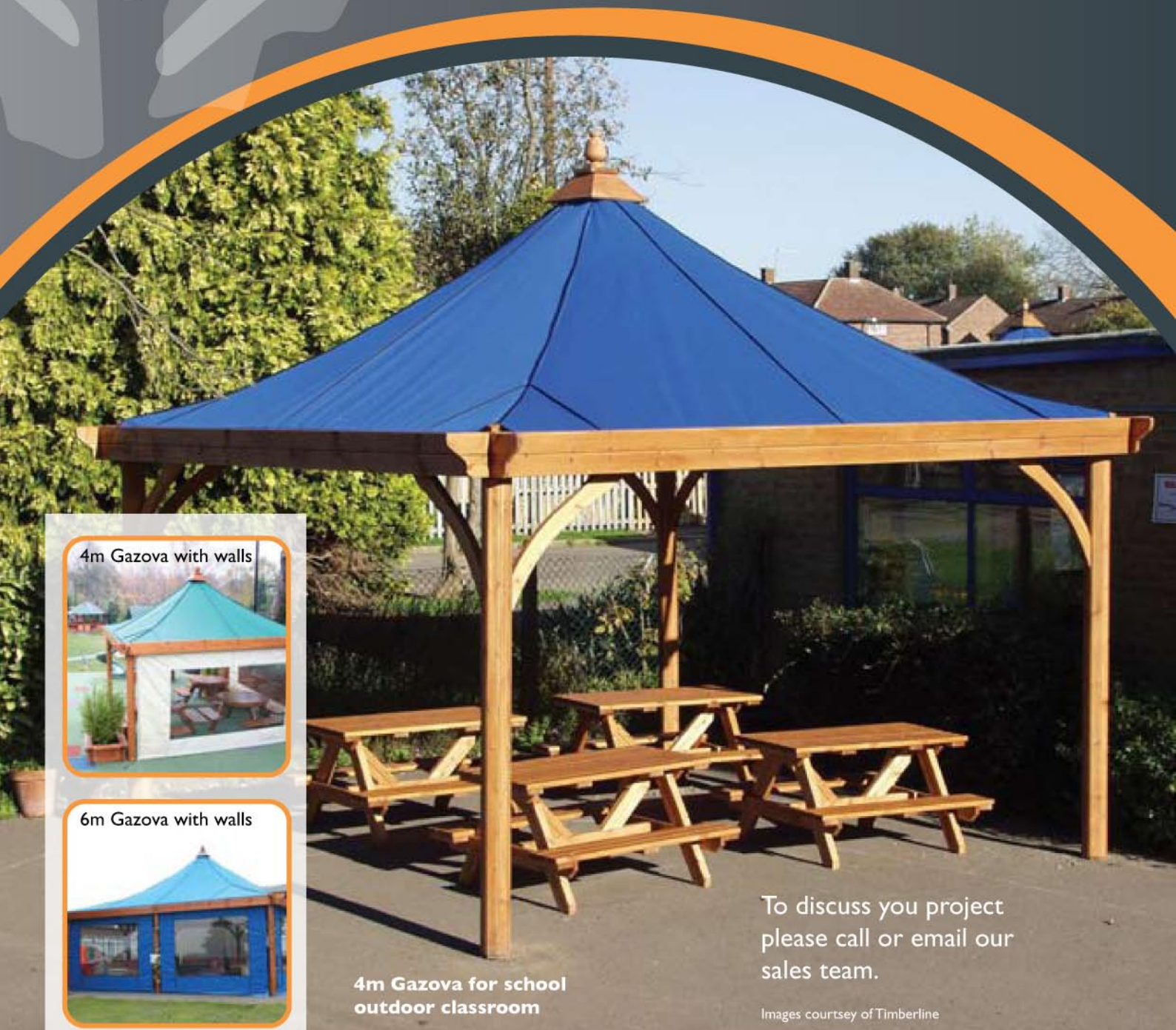
4m Gazova with walls

Specialised Canvas Services Limited is the parent company of Banner Box. It is involved in manufacturing and supplying a huge range of weatherproof textiles for industry, transport, leisure and the home. Our long experience ensures you will never surprise us with your requirements, and our emergency repair service will make sure you are never left out in the cold.