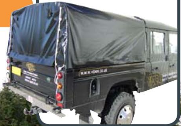
4x4 pickup canvas back

Heavy Duty PVC and canvas tarps, curtain sides, rollover sheets, nets, slings & load restraints. Covers for pickup trucks, golf buggies and plant machinery.