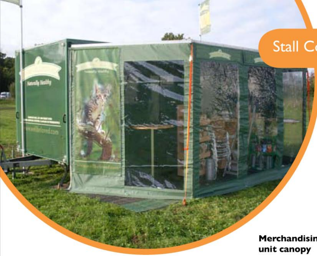
Merchandising unit canopy