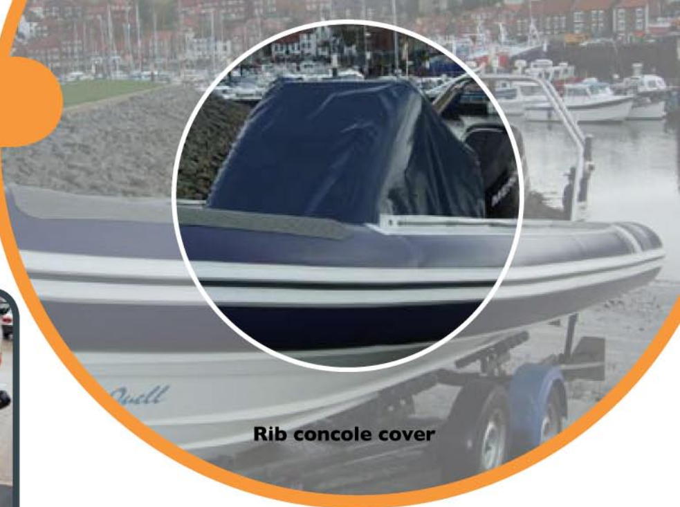
Rib concole cover