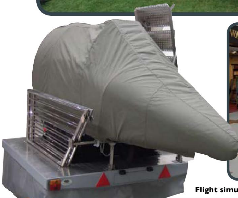
Flight simulator cover