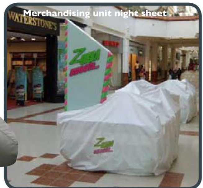
Merchandising unit night sheet