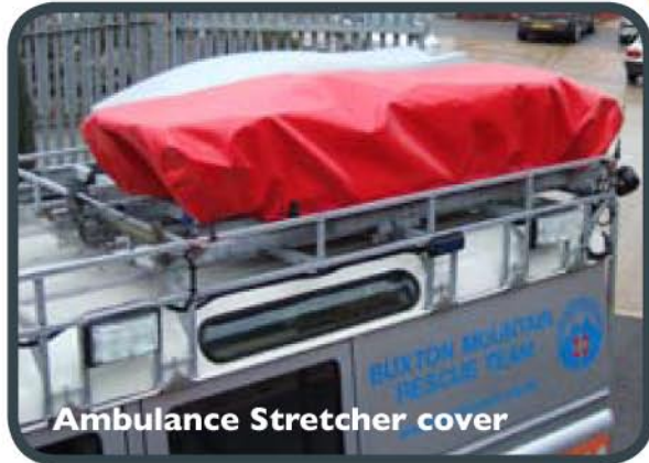
Ambulance Stretcher cover

Protective covers for commercial vehicles and machinery. Sporting covers cricket wickets. Covers cricket wickets.