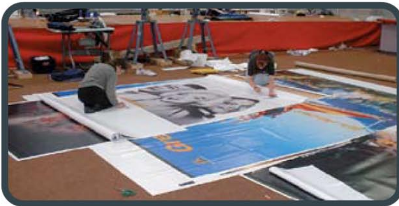
Trade Printed banner finishing